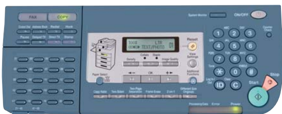
iR2016 / iR2020 control panel

The products of the latest in environmentally friendly manufacturing techniques, the iR2016 and iR2020 comply with the European Union's Restriction of Hazardous Substances (RoHS) directive. The most stringent environmental directive of its type in the world, its aim is to eliminate six hazardous substances from products.