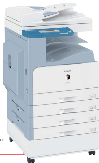
iR2020 fitted with additional paper supply and inner two-way tray