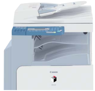
Inner two-way tray

The ID Management feature allows you to restrict usage to those with a valid ID and password. It can be used to control access to the device's features and set volume limits for up to 100 individuals or groups. This can be increased to 1,000 when additional memory is added.