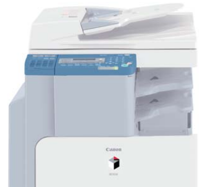
Finisher-U1 with additional finisher tray